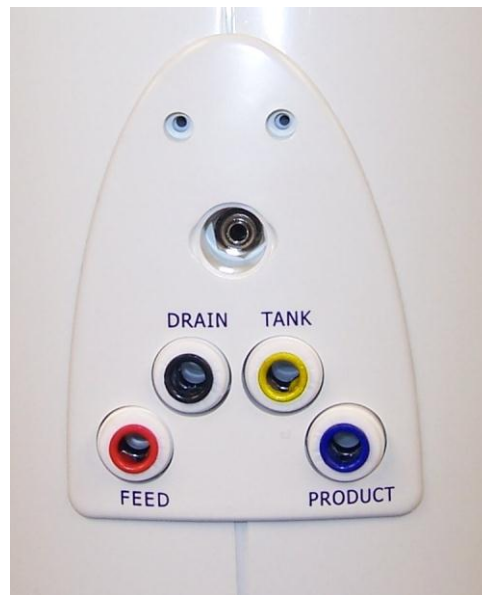
Figure 1: Connections for feed, drain, tank (for LINX 140T), and product water

If a systems are to be disconnected for any reason, FIRST ensure that the supply water is turned off and the faucet is opened to depressurize the system (open the faucet until water stops flowing). DISCONNECT THE POWER to the systems by detaching the power cord at the rear.