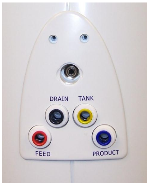
Figure 1: Connections for feed, drain, tank, and product water

If a system is to be disconnected for any reason, FIRST ensure that the feed water is turned off and the faucet is opened to depressurize it (open the faucet until water stops flowing). Then DISCONNECT THE POWER to the systems by detaching the power cord at the rear.